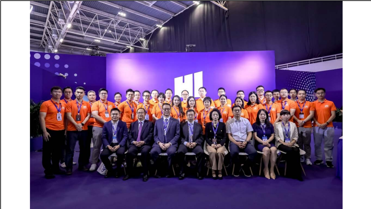
Cyberport led five start-ups to participate in the “2024 Hong Kong Talents Beijing Tour” co-organized by Hong Kong Alumni Association of Beijing Universities (HKAABJU) and Beijing Overseas Talents Center (BOTC).

For high-resolution photos, please download via this link .