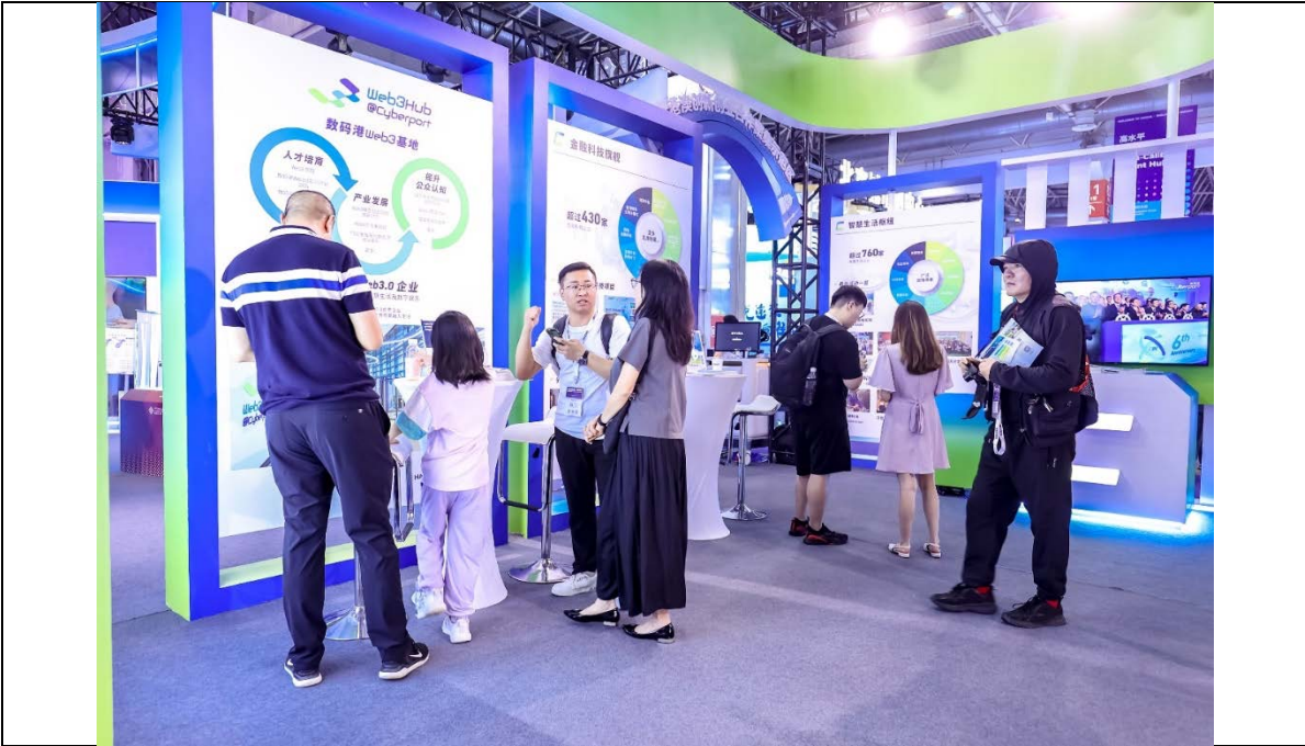
Cyberport led five start-ups to exhibit at the HICOOL 2024 Global Entrepreneurship Summit and Entrepreneurship Competition, to showcase Hong Kong's innovation and technology (I&T) achievements.