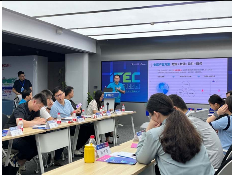
The Cyberport start-up representatives exchanged views on technology applications with local institutions and enterprises, exploring business development and cooperation opportunities.